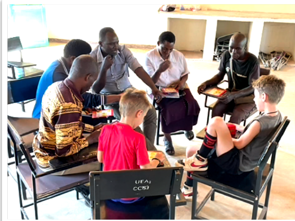
The boys enjoying playing a game with English students.