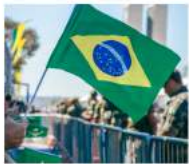
Independence Day: September 7, also Republic day: November 15