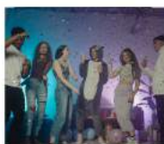
Dancing: music is very important and popular in Brazil