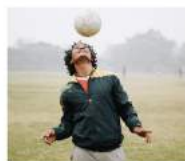
Soccer: the most popular sport in Brazil

1 Corinthians 10:31 NIV "So whether you eat or drink or whatever you do, do it all for the glory of God."