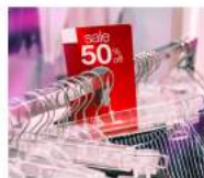
Shopping: malls in Brazil are called "Shopping," and they are very popular