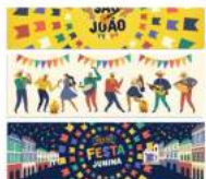
Sao Joao: June 24 a harvest festival with lots of corn