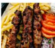
Churrasco: Brazilian BBQ that can last for hours while the meat cooks