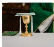
Corpus Christi: 60 days after Easter, celebrating the Eucharist