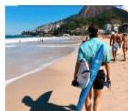
Going to the beach: Brazilians know how to relax!