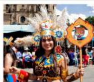
Carnaval: before Ash Wednesday which is 40 days before Easter

Colossians 2:16-17 NIV "Therefore do not let anyone judge you by what you eat or drink, or with regard to a religious festival...These are a shadow of the things that were to come; the reality, however, is found in Christ."