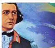
Tiradentes: April 21 For the national hero Joaquim Jose da Silva Xavier