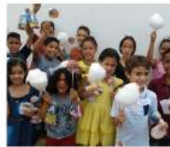
Children's Day: October 12 to celebrate kids!