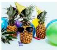
Parties: Brazilians love to celebrate!