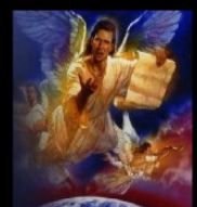
What my supporters think I do.