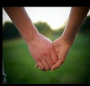
What I REALLY do.