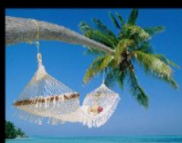
What society thinks I do.