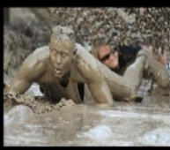
What I think I do.