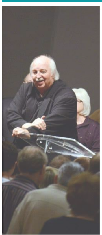
World Renewal est. 1986 Helping plant Christ-centered churches and leaders

1 Peter 2:5 NIV "You also, like living stones , are being built into a spiritual house to be a holy priesthood, offering spiritual sacrifices acceptable to God through Jesus Christ."