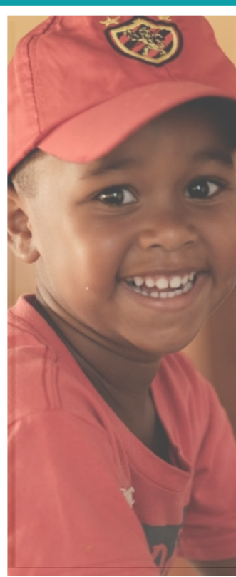
Living Stones est. 1998 Church planting through child sponsorship