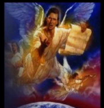
What my supporters think I do.