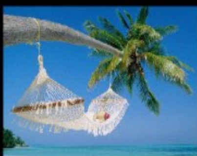
What society thinks I do.