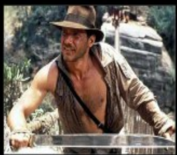
What my friends think I do.