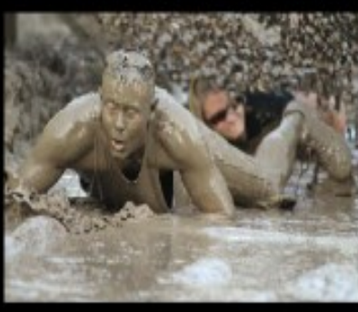
What I think I do.